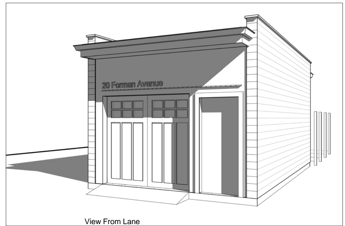
View From Lane