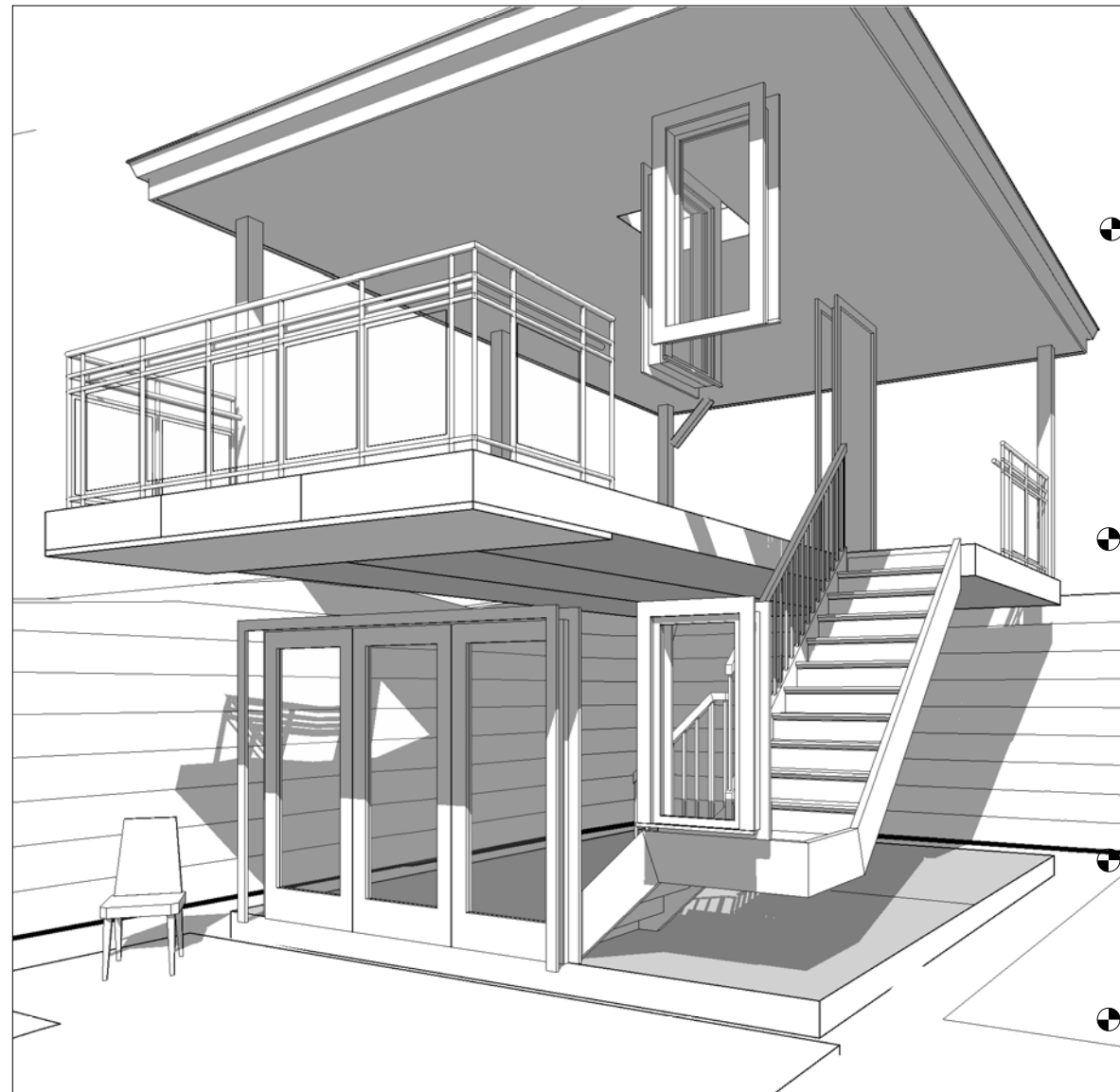
1 Sectional View