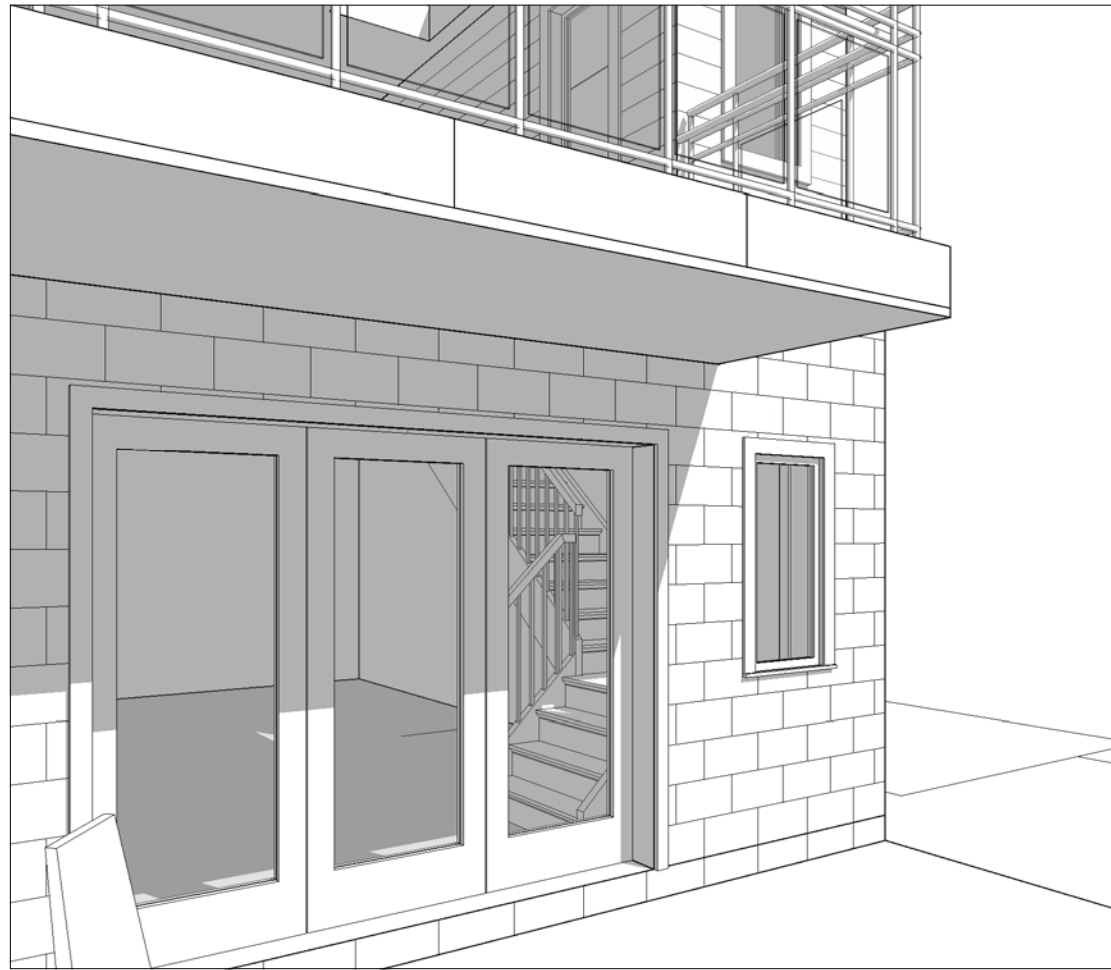
1 View From Patio