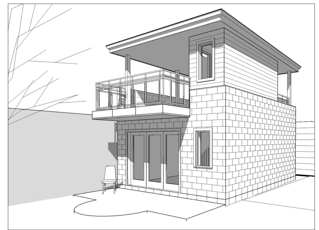
3 View from yard