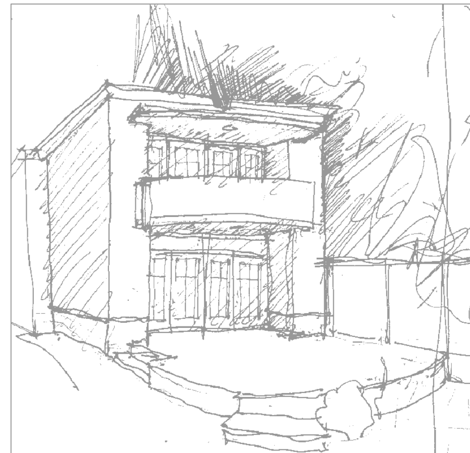
3 VIEW FROM REAR YARD TOWARD ADDITION Scale: NTS