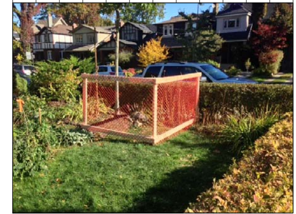
Tree Protection - Front Yard, North Side