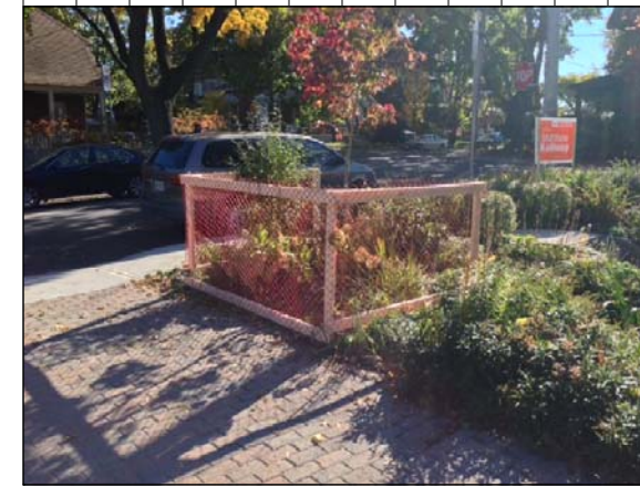
Tree Protection - Front Yard, South Side