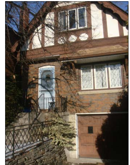
Existing house from street