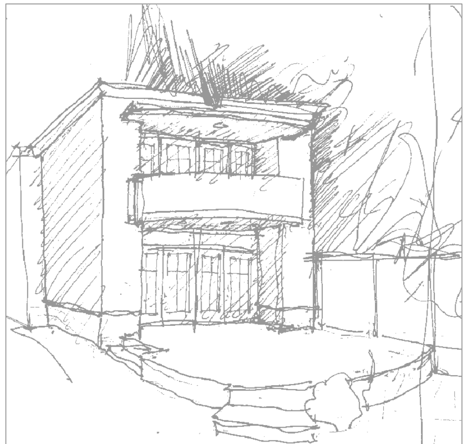
3 VIEW FROM REAR YARD TOWARD ADDITION Scale: NTS